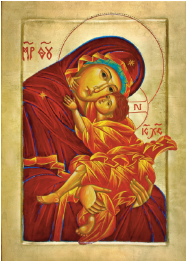
ROSARY PRAYER In Honour of the Mother of God